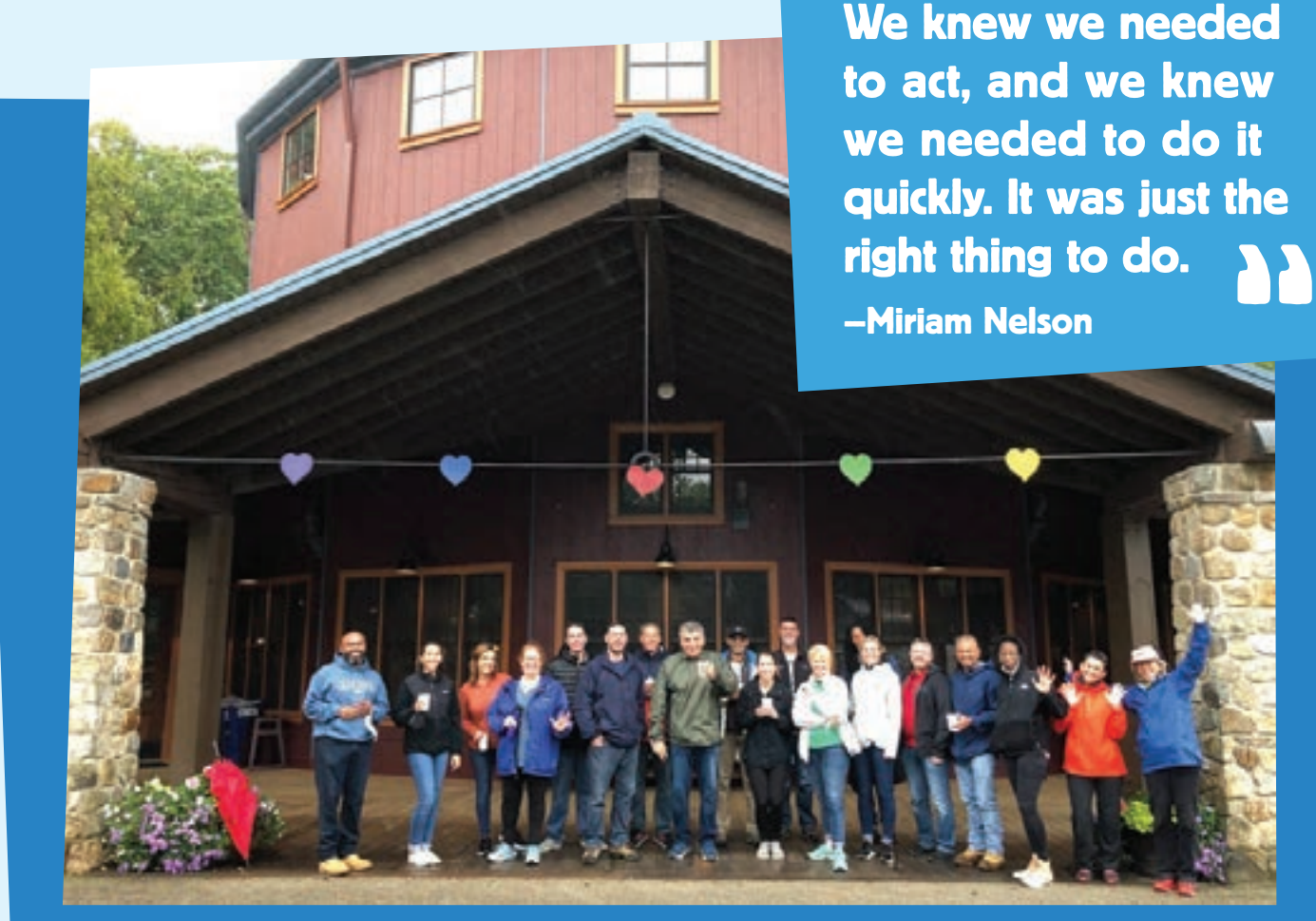
Not only is Newman's Own Foundation incredibly generous with financial support, but their employees also frequently provide in-person support at Helping Hands Workdays.

Newman's Own employees also come out to Camp regularly for Helping Hands Workdays. They make beds, sweep floors