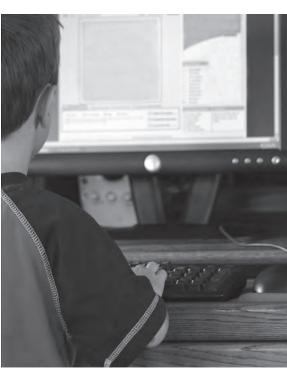
C&SWholesale Grocers generously assisted Camp with projects to update technology infrastructure to add to the joy and comfort of our campers.