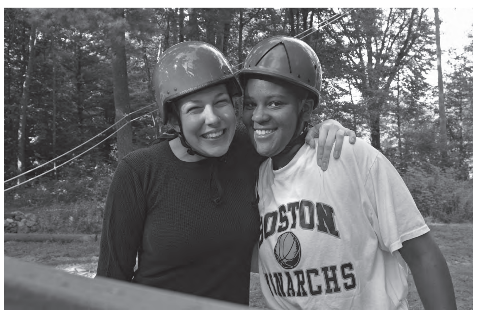
Camp is all about making great friends and great memories.