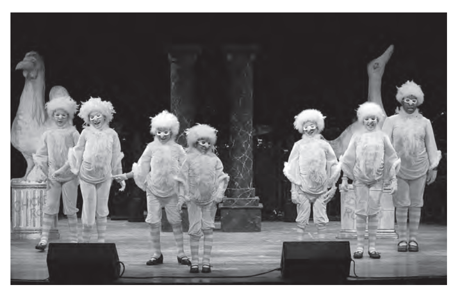
Camp's Gala, an honored Camp tradition, returns to Ashford this coming fall.