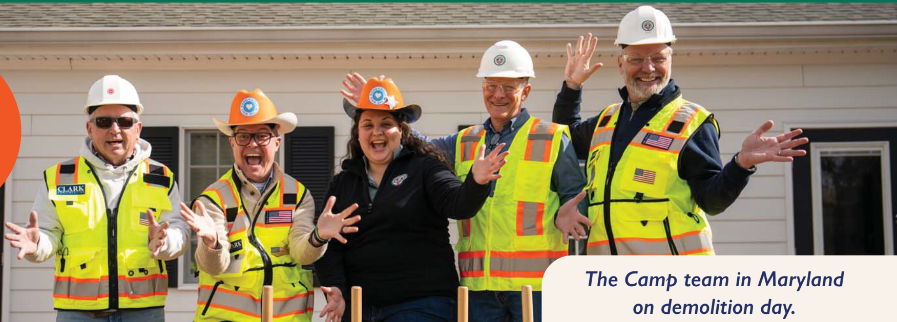
The Camp team in Maryland on demolition day.