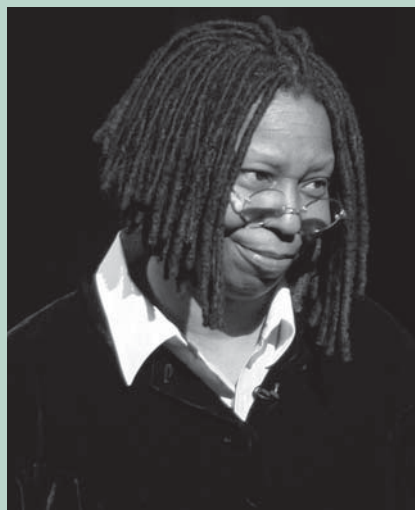
Performances at the 20th Anniversary Gala featured Harry Belafonte (top), Carole King and Bernadette Peters (left) and Whoopi Goldberg (above, right).