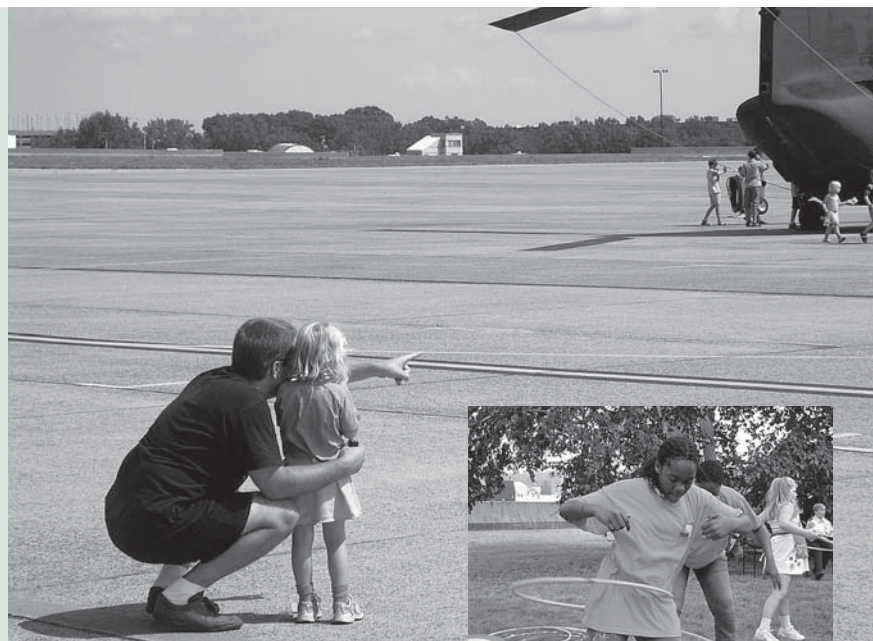
Children and families enjoy the sights, sounds, and activities at the 2007 Space and Aviation Day Event.

Space & Aviation Day, Bradley Family Day's largest annual event, takes place on Saturday, July 12, 2008 at Bradley International Airport. This summer extravaganza, that drew 7,000 participants last year, showcases aviation, flight and space exploration through a wide range of aircraft displays, activities and demonstrations. The Connecticut Air National Guard, State Police and Connecticut Fire Academy host lively and informative