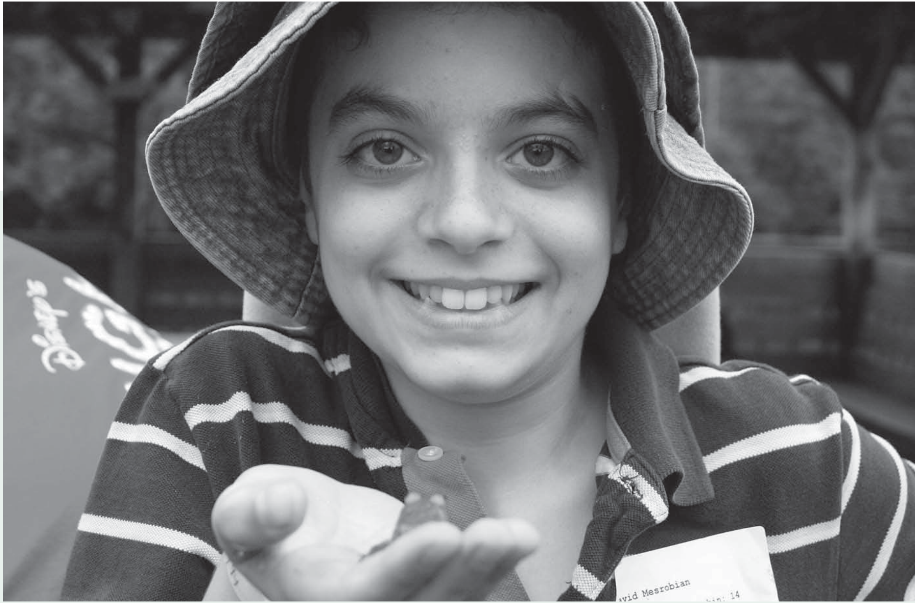
Camp is full of surprises!

"Talk to any camper. You'll get the same answer. It can't be described, but there's a magic to Camp, and it doesn't rest in Ashford. It's the magic of belief...the belief that you're the best dancer in the entire dining hall. The belief that you can eat all the Lucky Charms you want and never get sick. The belief that you can beat your counselor in basketball every single time you play him...while you're here, anything and everything is possible."