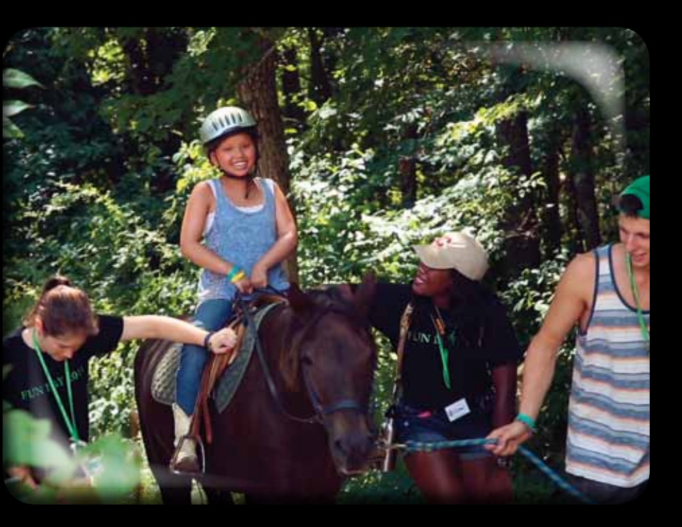
Camp's new promo video and website capture Camp's whimsical spirit while highlighting the depth and breadth of programming offered.

As we move into summer, we're looking forward to our very first Family Camp – a very special four-day session targeting families who have never been to Camp before, children with a high level of medical acuity and those who require the presence of a family member or caregiver. We also can't wait to welcome everyone into our newly renovated cabins. After the Yellow Unit renovation last year, we took notes on what worked and what needed to be adjusted, and now, all five units boast updated bathrooms, improved storage and increased energy efficiency. We can't wait to see what else summer has in store!