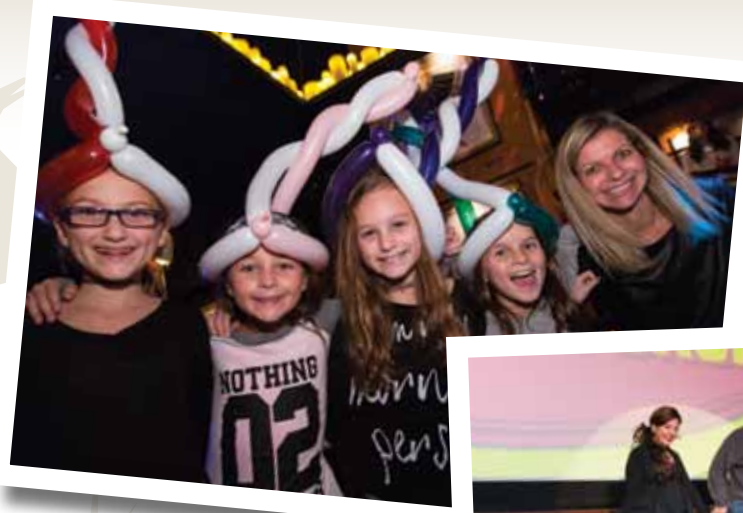
Above: Balloon art – one of the many activities guests enjoyed at this year's Big Apple Bash.

Thanks to the support of the "Greatest Sponsors on Earth," LiDestri Food & Beverage and American Packaging Corp., as well as hundreds of donors, this year's Big Apple Bash raised more than $1.25 million to support The Hole in the Wall Gang Camp – a record for the event.