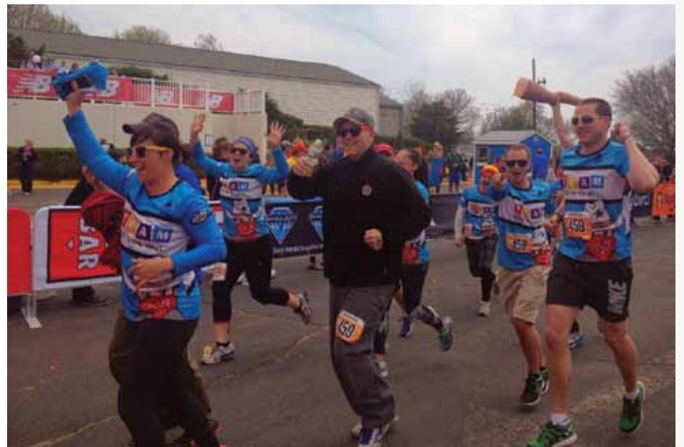
A group of Team Hole in the Wall runners tested the waters at last year's Ragnar! Their smiling faces say it all - and a partnership was born.