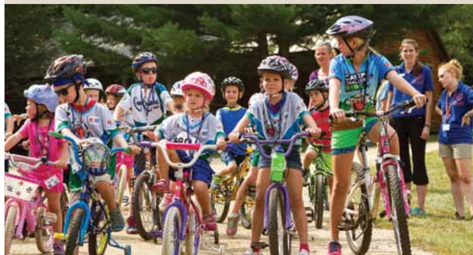
Kids participating in the Camp Challenge Ride are just some of the young philanthropists who will be able to double their fundraising through the Positive Tracks grant.