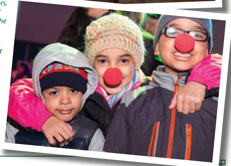
Bottom: Clown noses were a common sight at this year's circus.