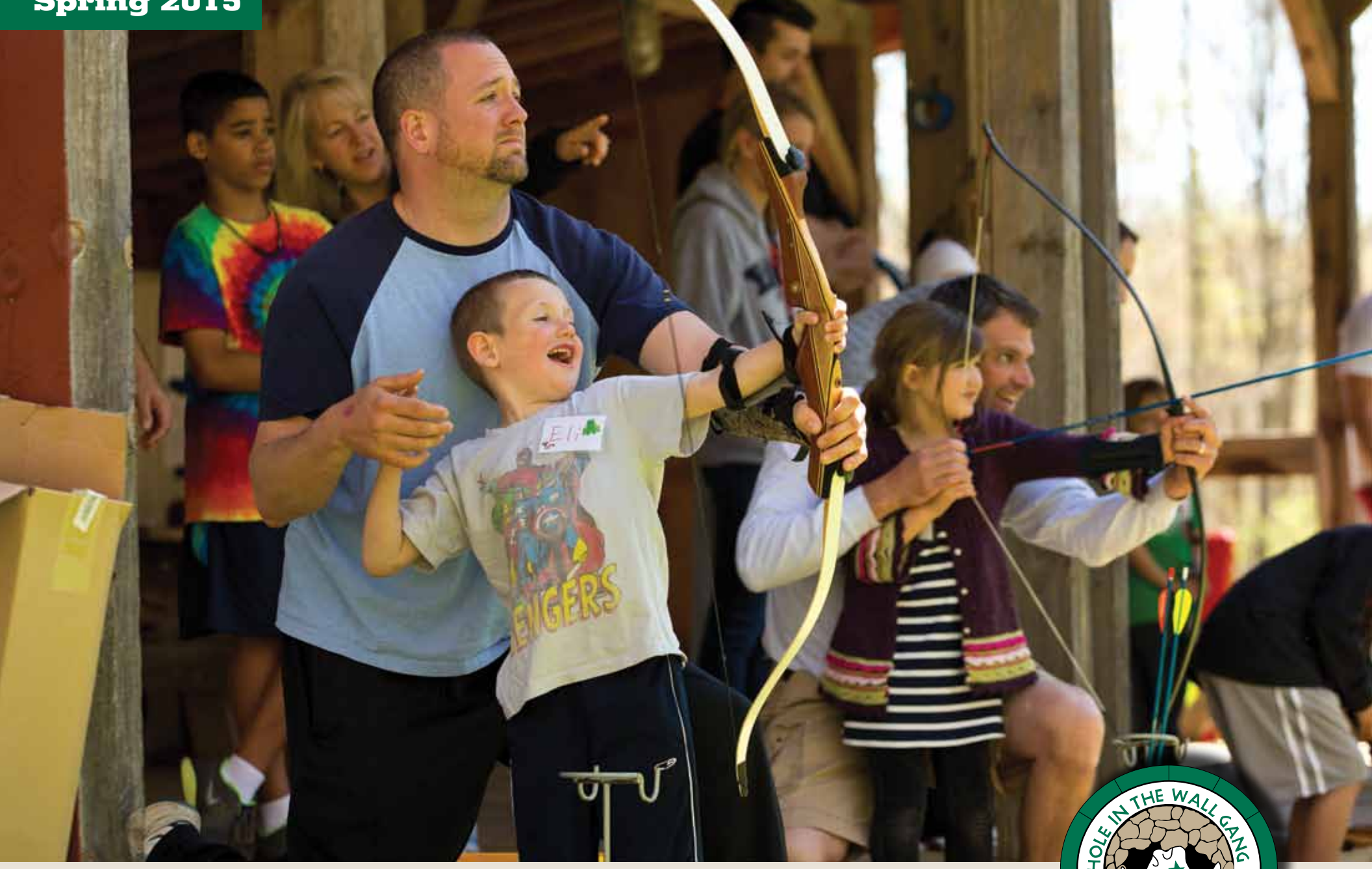
Families share special moments at Camp's Family Weekends