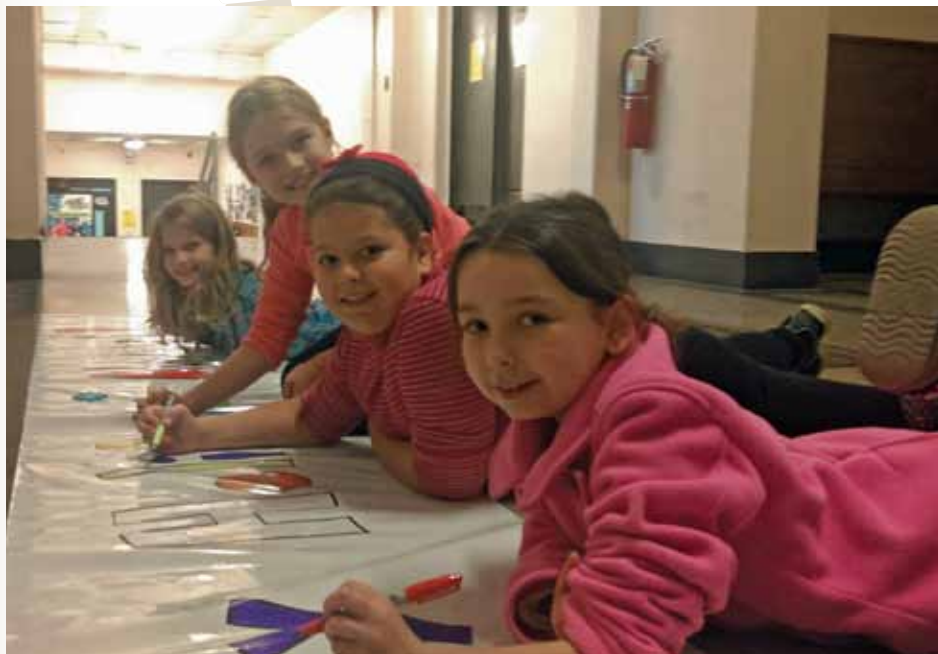
Students at The Nelson Place School work on a banner to help spread the word about Camp.