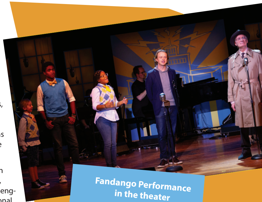
Fandango Performance in the theater

After the show, the celebrations continued well into the night, with guests enjoying a dinner buffet, s'mores bar and Whey Grilled Cheese along with entertainment by Shake, Rattle and Roll Dueling Pianos. It was truly a day to remember.