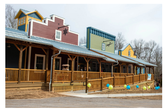
The facade of the brand-new Creative Complex.

Two years after fire, Connecticut's Hole in the Wall Gang Camp unveils rebuild