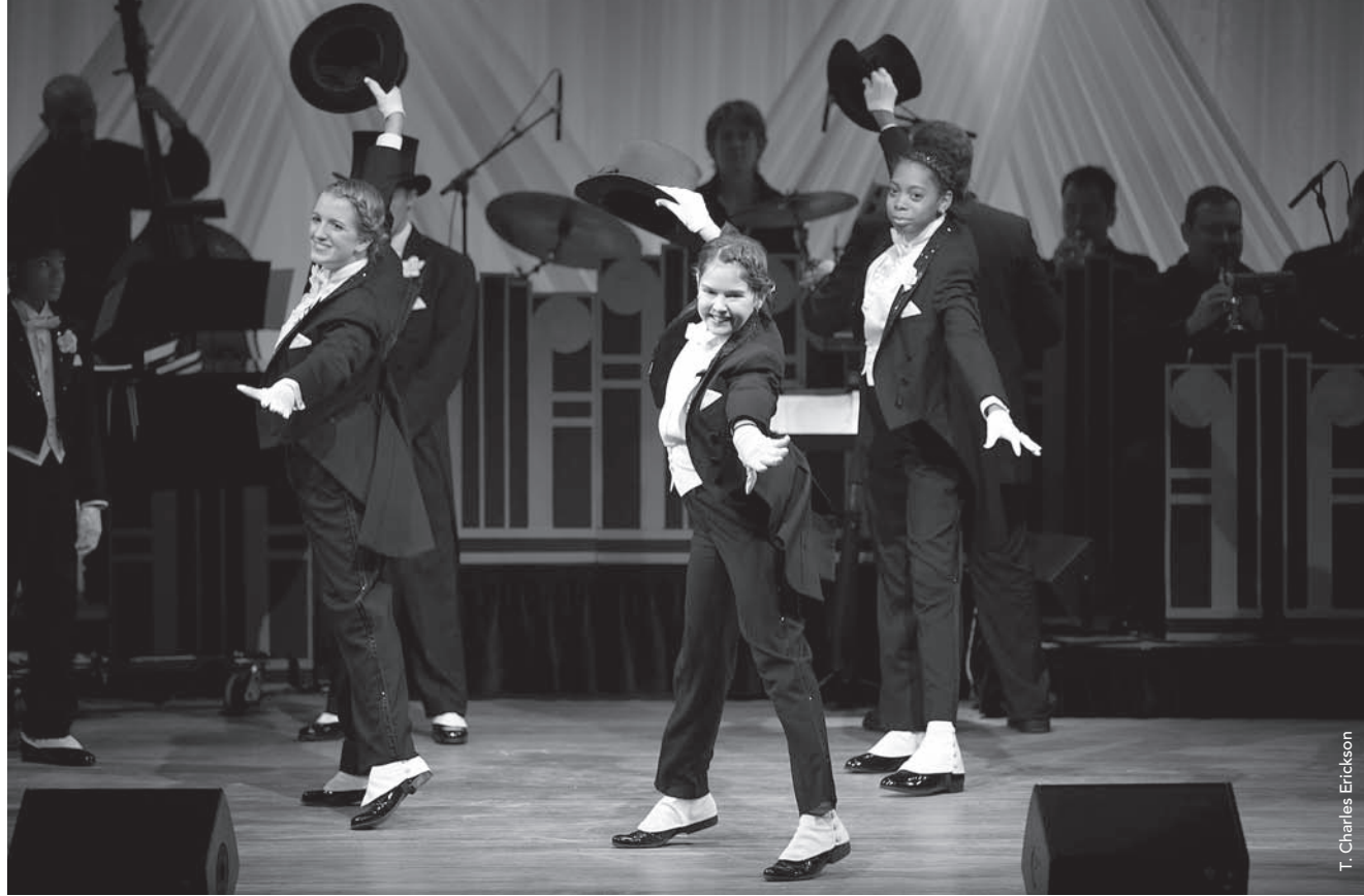
As always, our talented Hole in the Wall campers stole the show.

his connection with the Camp this past summer by serving as a volunteer cabin counselor. “After years of riding arduous AngelRide miles and finding strength in each camper’s journey, I elected to volunteer at Camp this summer to meet the focus of my inspiration... What I found was not just a camp, but a transforming experience; not merely counselors, but pure positive energy; not sick kids, but unimaginable strength and optimism. My parting thoughts as I walked toward the parking lot were of Paul, our founder, who left in our care an incredible place of integrity, dedication and love from which we can all replenish our souls.”