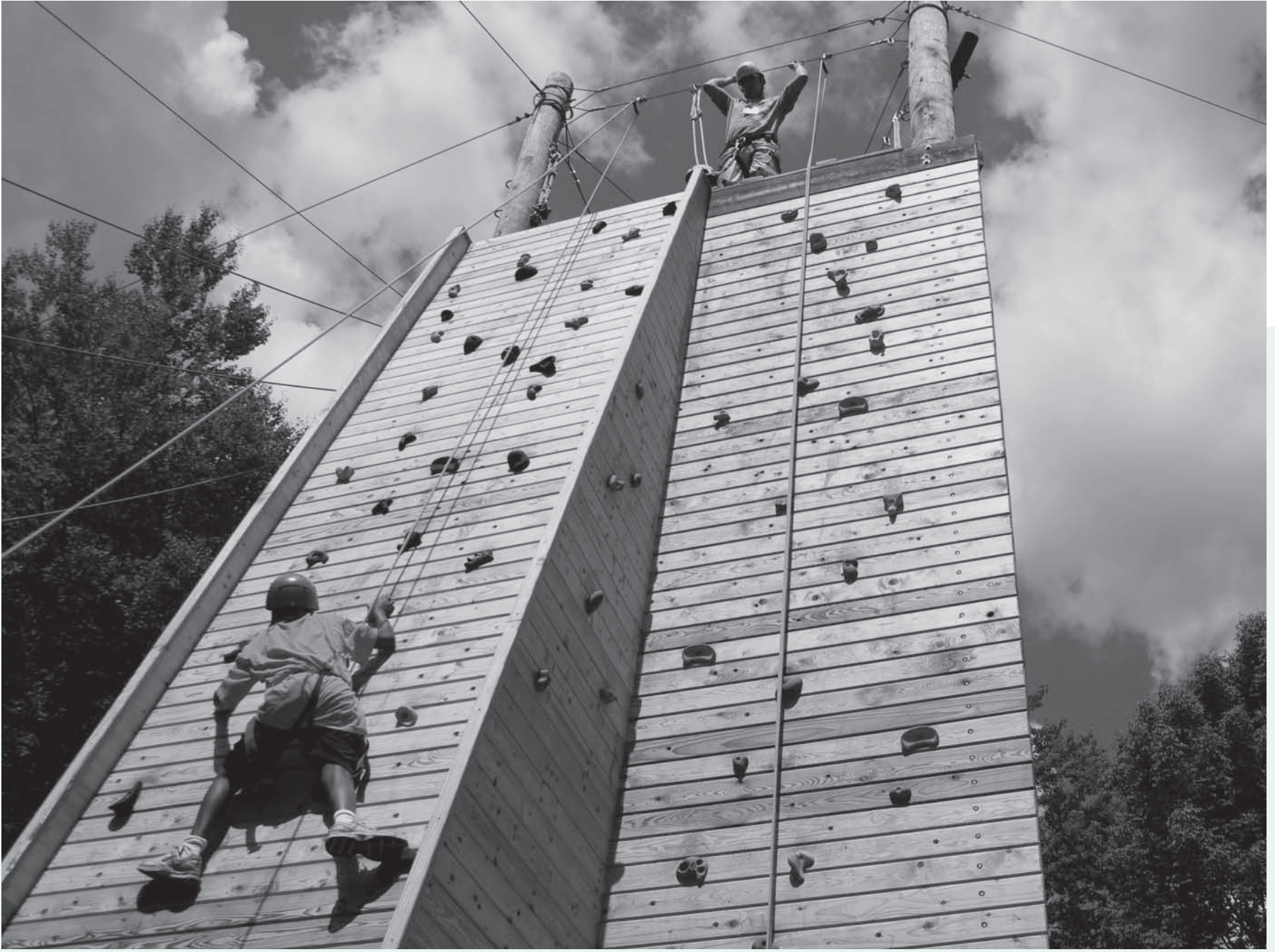
A sunny day, a tower to climb and new 900-foot zipline to zip! What could be better?