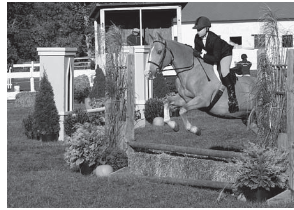
Folly Farm Stables provides generous support for Camp through The Folly Farm Classic, a regional benefit horse show now in its seventeenth year.

The affinity for riding horses is probably best appreciated by those who engage in the sport. Our friends at Folly Farm Stables have a true passion for riding and fully understand how it can help children break through the limits placed upon them. Folly Farm Stables is a public riding school and equestrian facility located in Simsbury, Connecticut. This National Historic Registry farm helps riders of all ages and abilities develop their riding skills. Folly Farm riders have successfully competed in horse shows at the local, state and national levels. On top of it all, Folly Farm provides unwavering support for Camp through The Folly Farm Classic, a regional benefit horse show now in its seventeenth year in which riders from all over New England compete in a variety of class competitions.