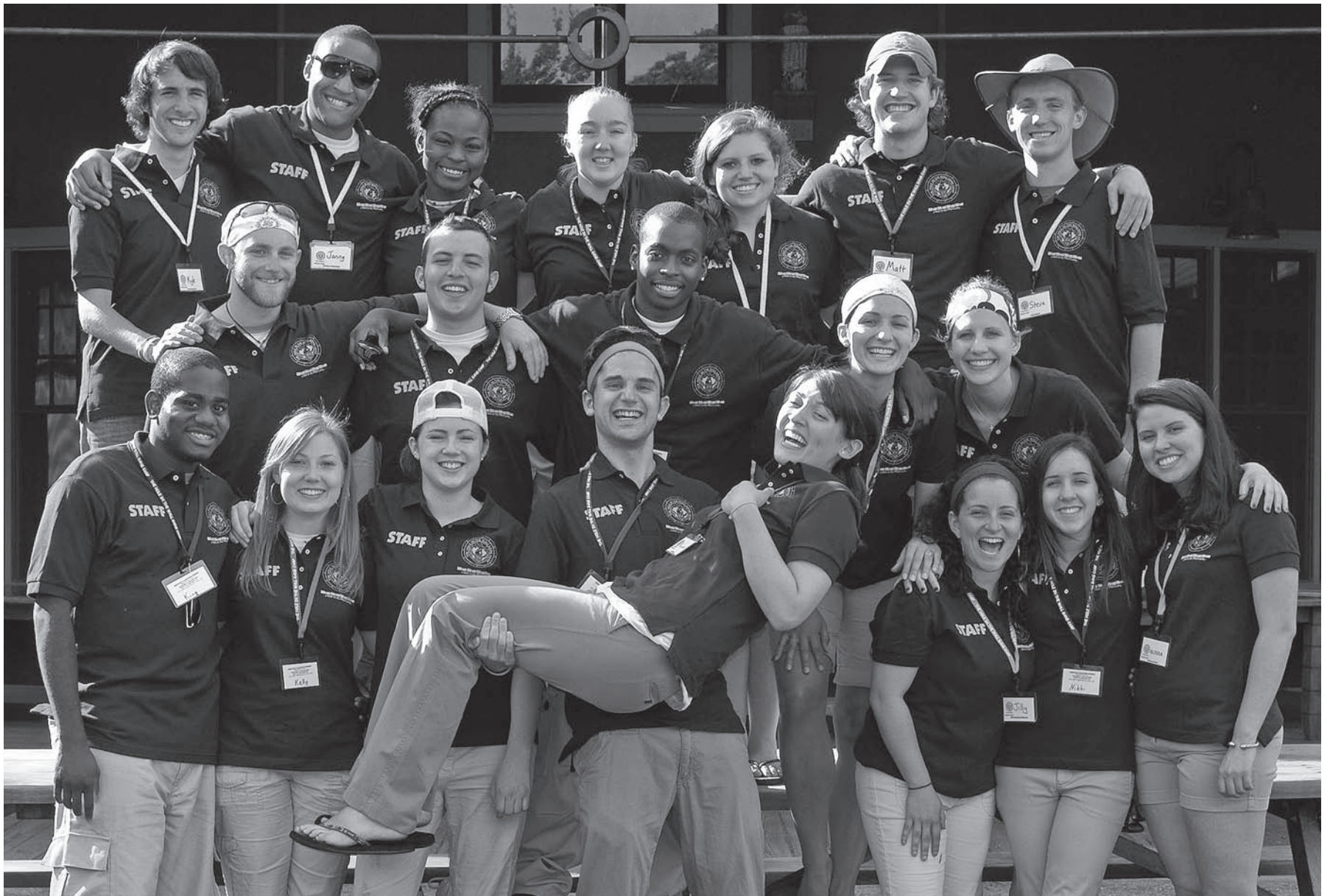
Summer 2009 at The Hole in the Wall Gang Camp saw the largest number ever of former campers serving as counselors.