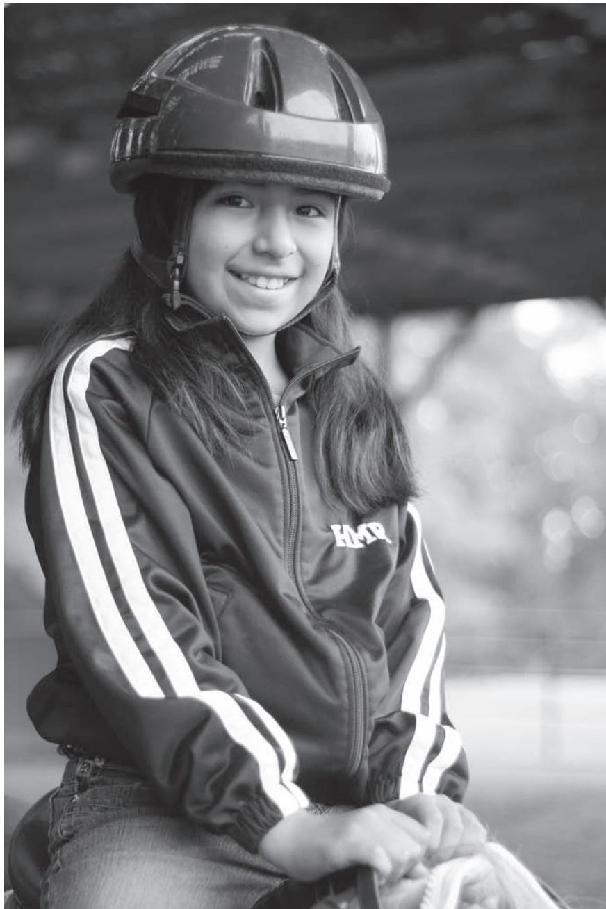
With support from Folly Farm Stables, Hole in the Wall campers enjoy an outstanding summer camp experience that includes horseback riding as one of many exciting program activities.

Upon arrival at Camp, many of our campers have their faces glued to the windows as their car or bus rolls past the grazing horses just beyond the Camp's entrance. Crazy for all things Camp, the kids love the horses. And not just in the way you love a good read, or a well-made S'more... more like a chocoholic's love for a generous helping of Ghirardelli's finest after abstaining from all things cocoa for twelve months. A natural fit for Camp's western theme, the riding program has been a staple at Camp since the beginning, and for twenty years, children have been smiling ear to ear as they ride along the dirt roads and wooded trails. For children with serious illnesses, especially those that have mobility issues, Camp is often the only place where riding is an option, and the kids carry those memories for years to come.