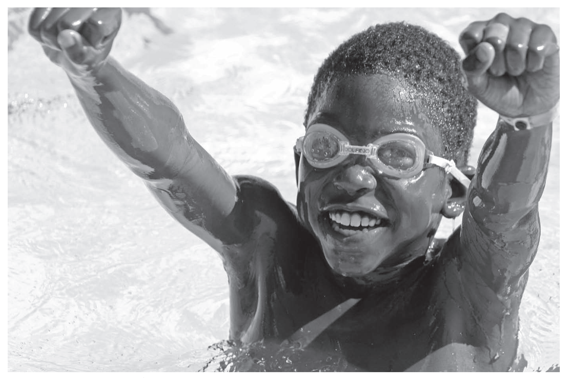
It's summer at Camp and there's no better time of year!