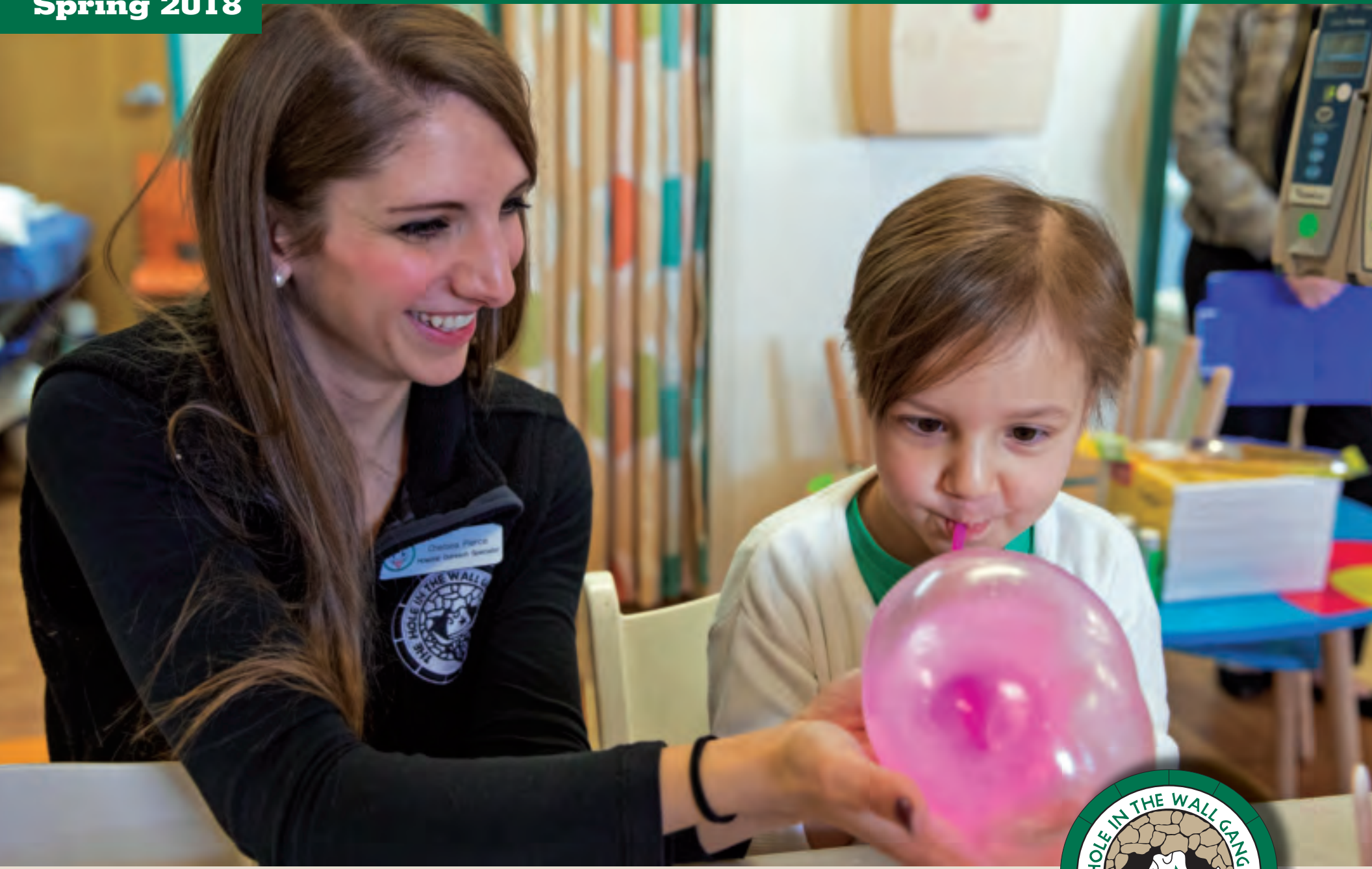
Through Hole in the Wall's Hospital Outreach® program, children are able to experience Camp fun, even while undergoing treatment.