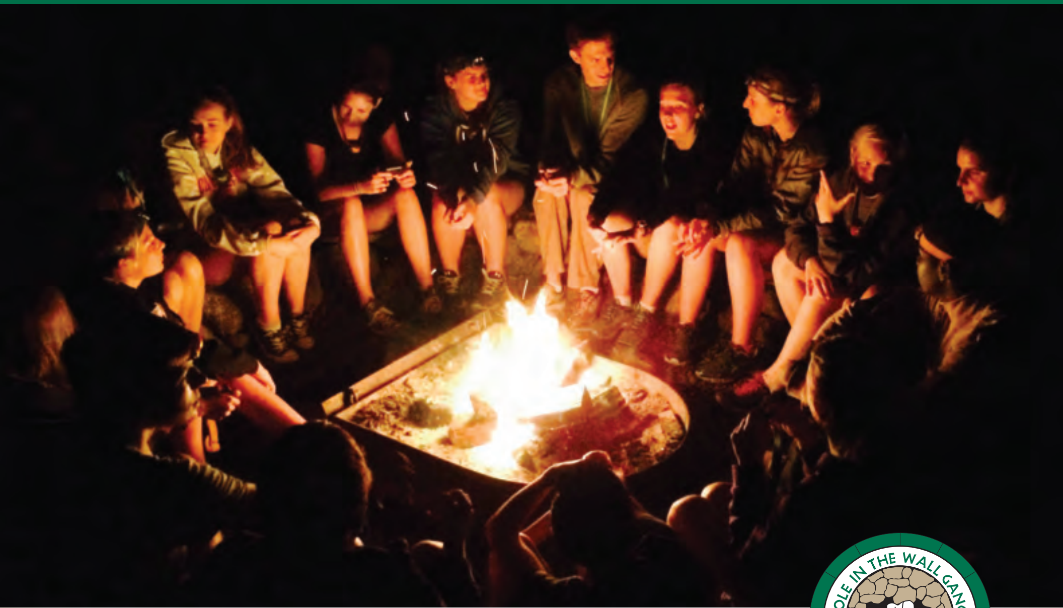
At the Hero's Journey® program, campers discover what they are capable of while building friendships with fellow participants.