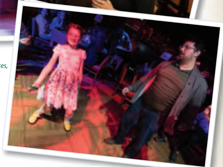
Left, Above, Right: Circus performances, dancing and food, oh my! There was something fun for everyone at the 26th Annual Big Apple Bash.