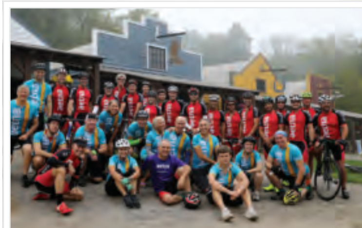
Aetna employees always have a strong showing of support at the Camp Challenge Ride.