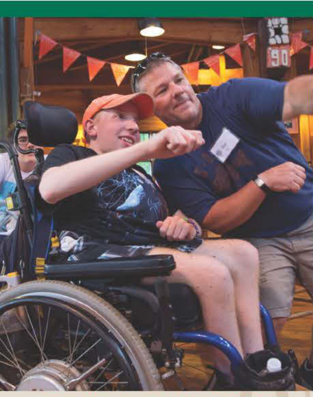
Thanks to a generous grant from the Diebold Foundation, families were able to have a true Family Camp experience this summer.