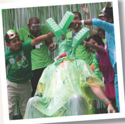
Always a favorite, Slime is a prescription for guaranteed smiles and laughter.