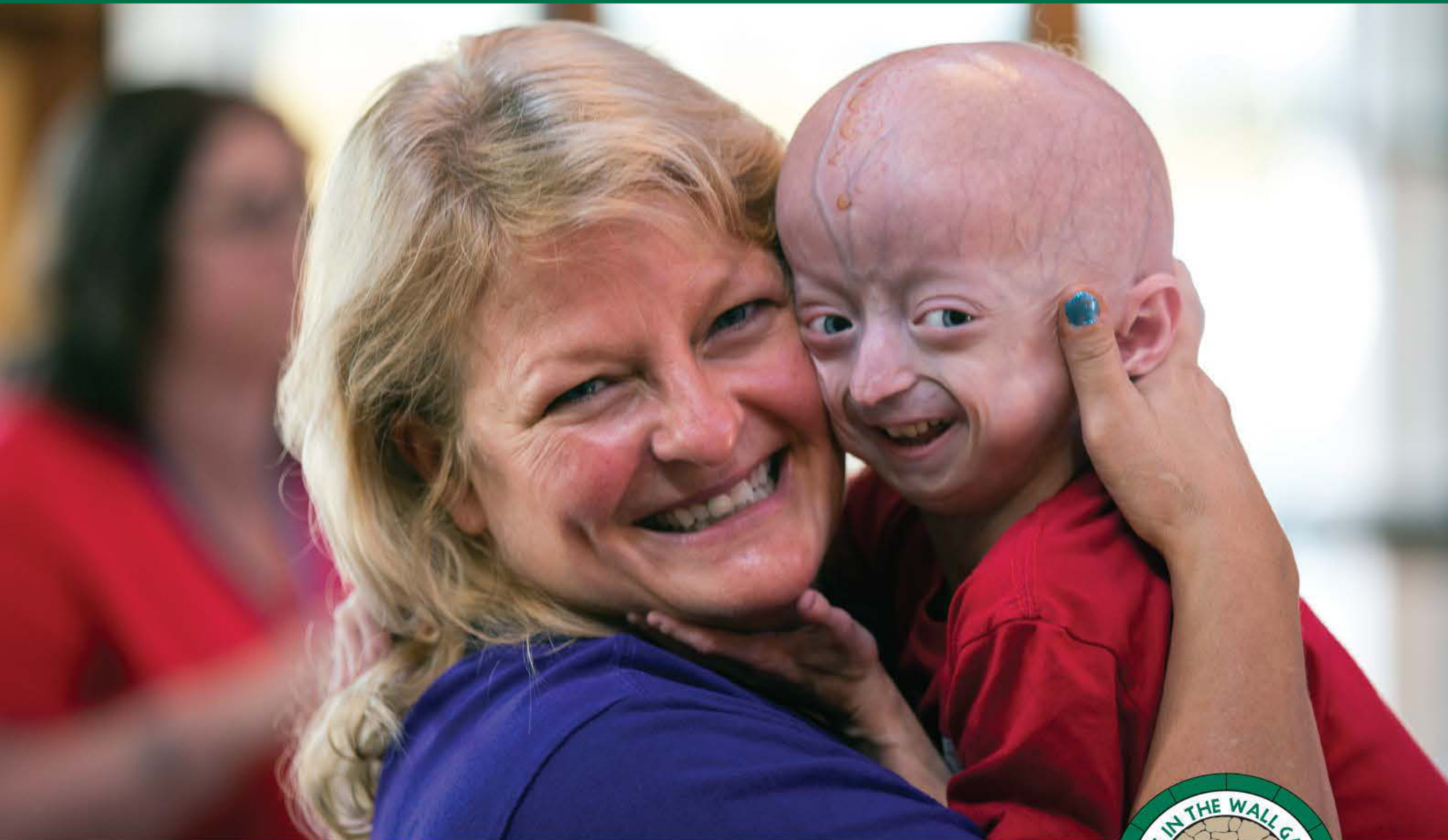
Hole in the Wall's new Family Camp provides a summer camp experience the entire family can enjoy!