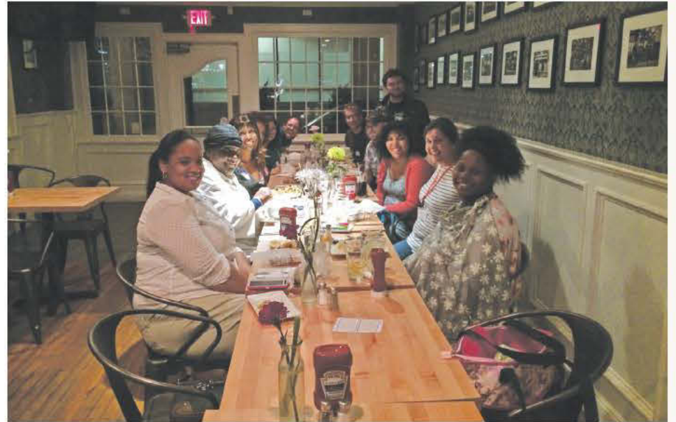
The New Haven Family Dinner brought together former campers, volunteers and Camp staff for an evening of fun, friendship and laughter.

At a recent family dinner, 12 alumni and family members gathered at Trinity Bar and Restaurant in New Haven to share reminisces about their time at Camp and to hear what old friends were doing. The table included aged-out former campers, former volunteers and folks who have been involved with Camp in multiple capacities. It was a great