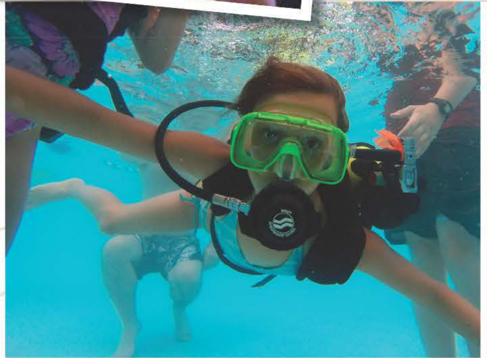
Anyone up for a game of underwater tic-tac-toe?

The Frogmen Volunteers work with local dive shops to secure air donations, repairs and donations of gear. The community also rallies around the Frogmen, helping with monetary donations to purchase and