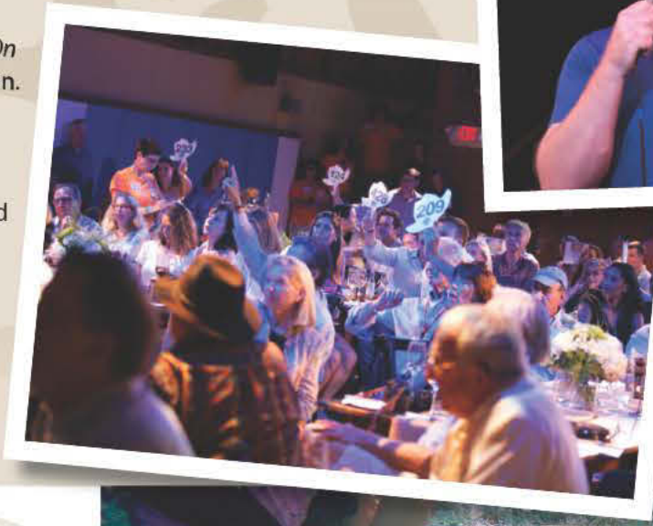
Jim Gaffigan got the crowd laughing at the Fandango performance (above), while guests showed their generous natures at the live auction (left).

The lively show got the crowd excited for the post-performance party featuring a buffet dinner and dancing. In all, this year's Gala raised more than $1.2 million for Camp's growing programs, thanks to our generous guests and supporters including presenting sponsors American Packaging Corporation and Travelers.