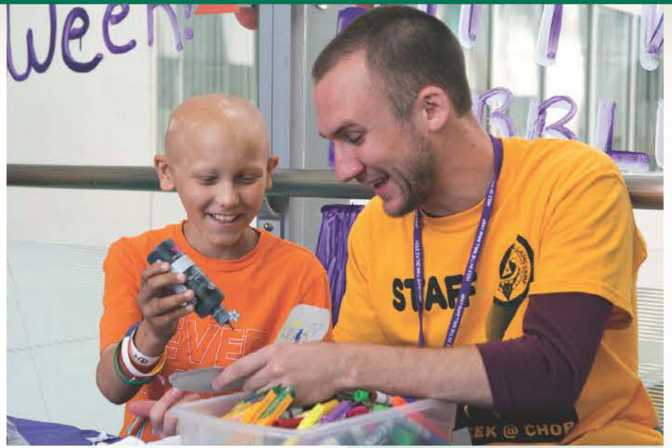
HOP participants got to experience Hole in the Wall magic with special summer activities like CampWeek at CHOP.

Down in Philly, CampWeek once again took over the Children's Hospital of Philadelphia, with a full week of programming. Unit pride was everywhere as banners, posters and cheers were found on every floor of the hospital. Carnivarty and perennial