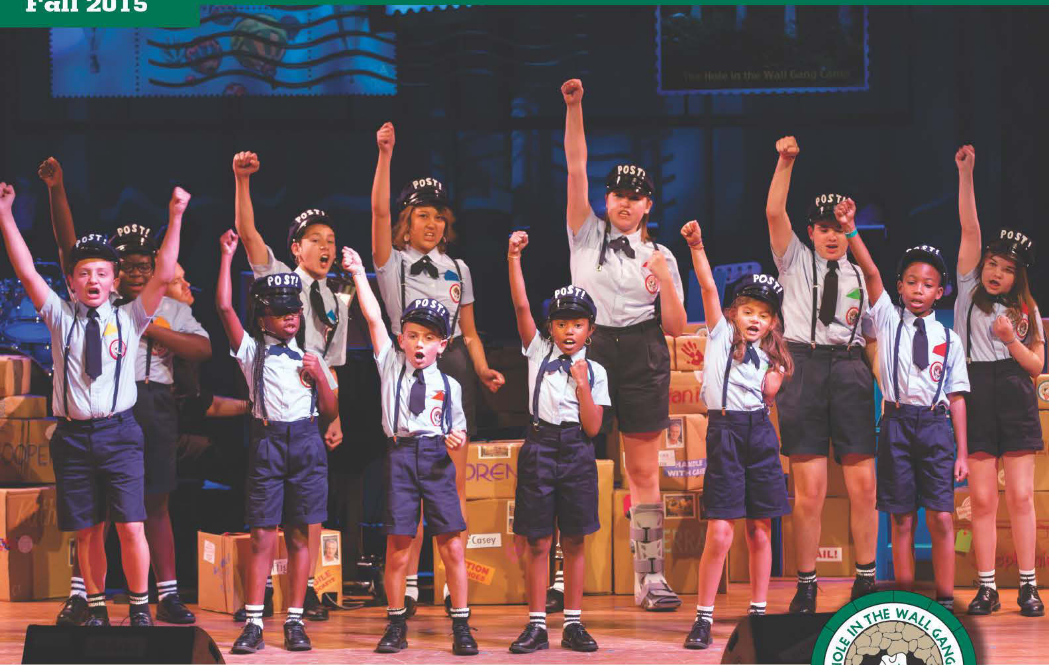
The campers starring in the 25th Fandango Benefit Gala sure didn't "mail-in" their performance!