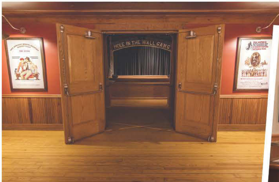
Camp's updated Theater entrance (above) and new Archives exhibit (right) pay homage to our Founder, Paul Newman, and his extraordinary legacy.