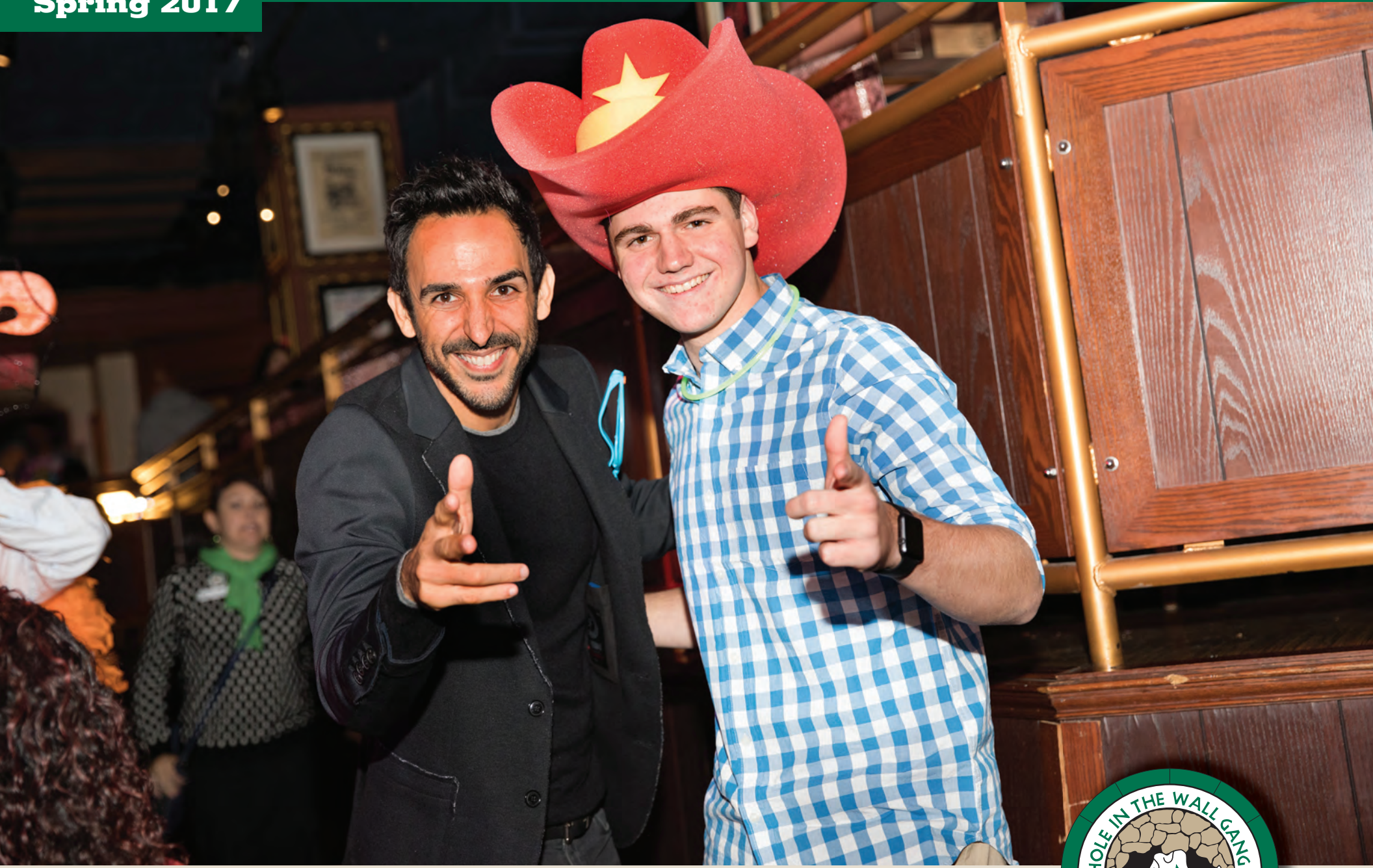
Camp friend and actor Amir Arison from NBC's hit show The Blacklist and camper Braeden show their silly side at the Big Apple Bash.