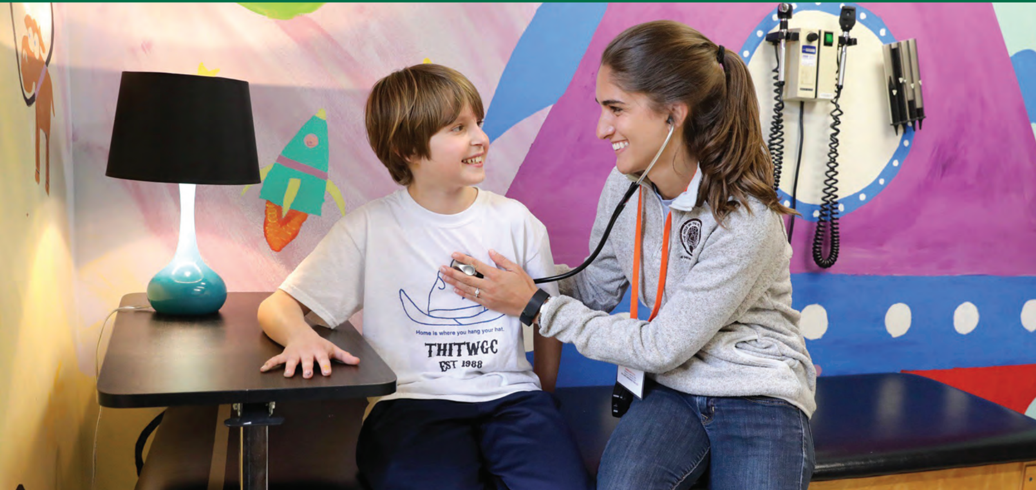
With bright decorations, a relaxed atmosphere, and many Camp smiles, the OK Corral doesn't feel like a typical infirmary.