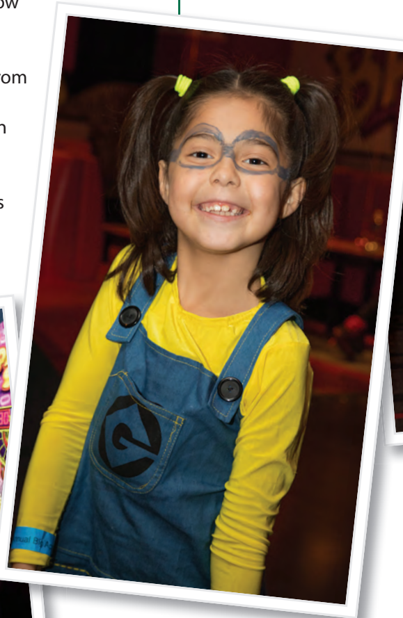
There were smiles all around at this year's Big Apple Bash!