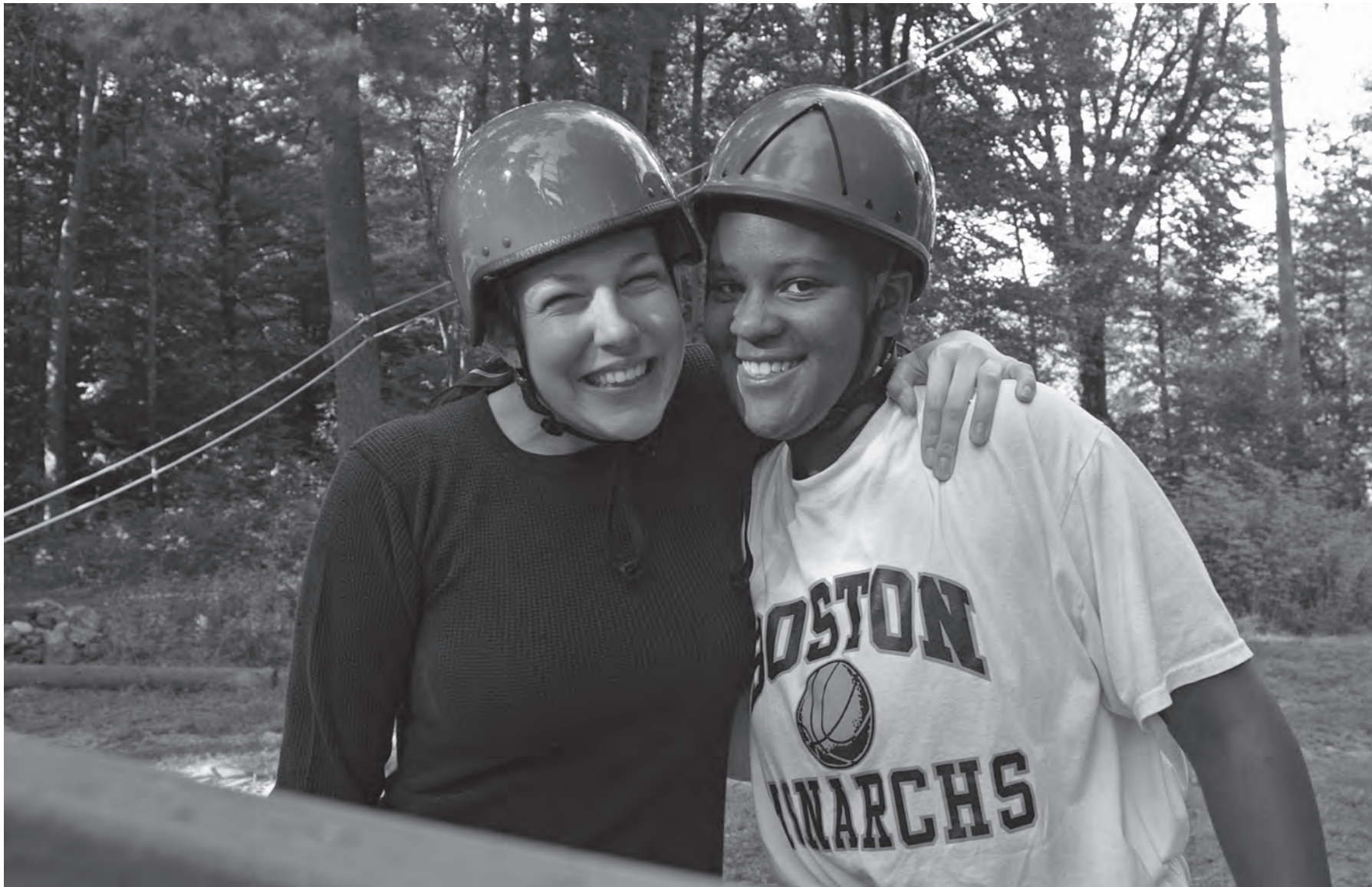
Camp is all about making great friends and great memories.