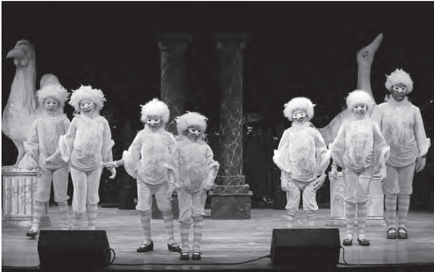
Camp's Gala, an honored Camp tradition, returns to Ashford this coming fall.