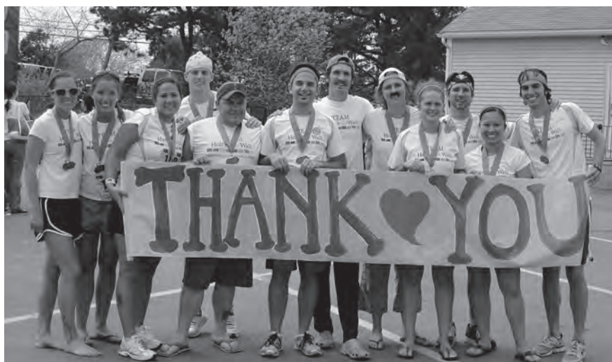
Below: Camp staff volunteers and friends thank their supporters after completing the 200-mile Cape Relay to raise funds for Camp.