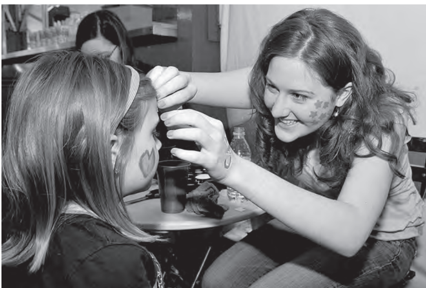
Camp's circus events in Boston in April and New York each fall provide wonderful performance and get-together opportunities for camper families and donors.

When Paul Newman started The Hole in the Wall Gang Camp, who could have foreseen its remarkable growth? Today, Camp serves more than 15,000 children each year through its signature summer program, family and camper weekends from fall through spring, and its outreach program to hospitals across the northeast.