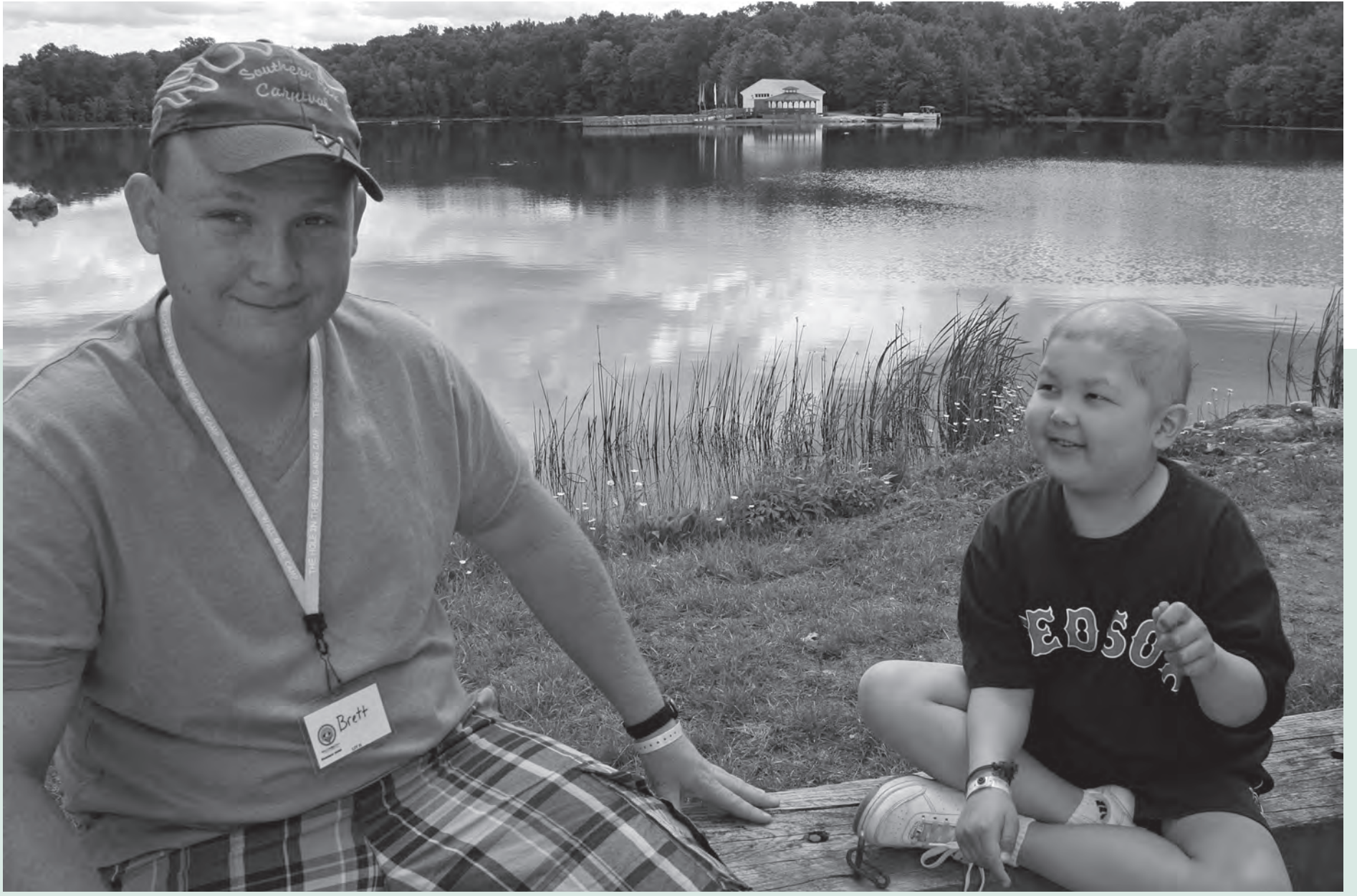
Take a deep breath and enjoy the stillness of Pearson Pond.