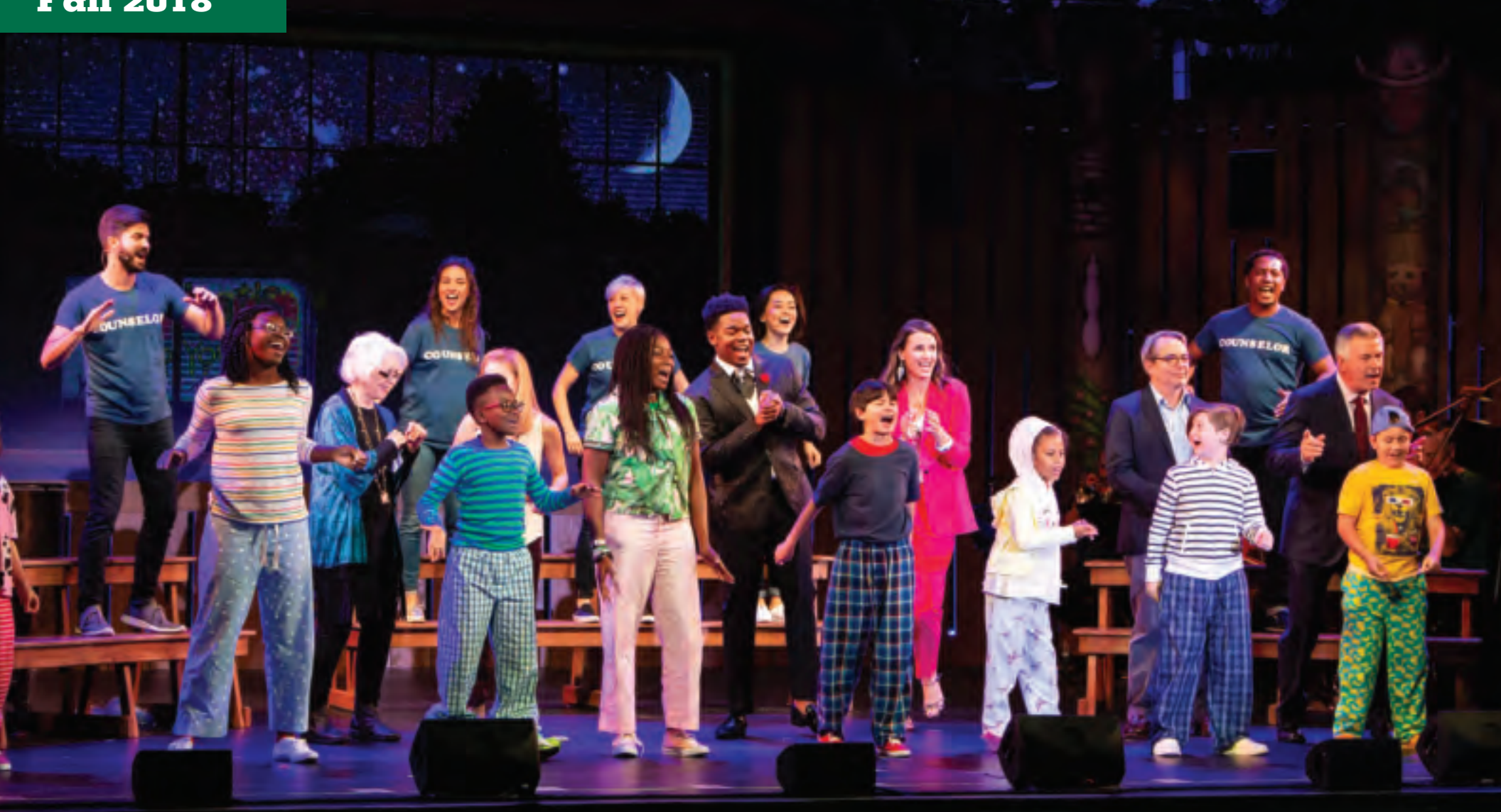
Nine incredibly talented campers joined Camp celebrity friends Ellen Burstyn, Dexter Darden, Bridget Moynahan, Matthew Broderick and Alec Baldwin to sing "Stars in the Sky" during the finale of the Bandits in the Big Apple 30th Anniversary Celebration.