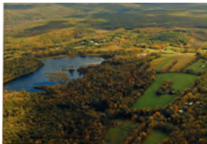
Camp when it was first discovered (above) and today (below).